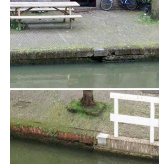
Severe damage in walls and bricks at the Utrechts trade-yards

Since 1950 the old trade-yards and storage vaults have been renovated and sealed against penetrating water. From that time they are commercially used and have become a major tourist attraction. There's a danger of