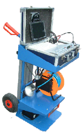
Monitor on trolley